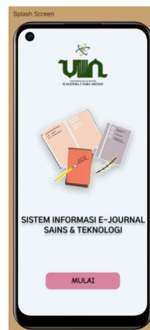
Fig 2: Home Page