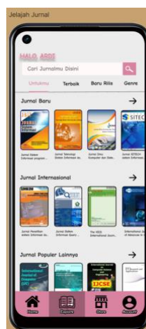
Fig 5: Journal Search Page