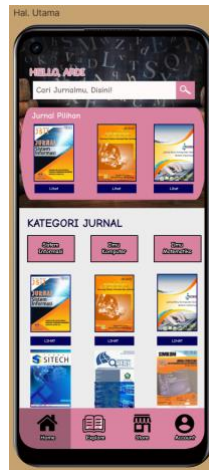
Fig 4: Dashboard Page