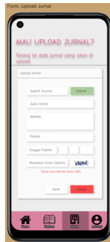
Fig 6: Journal Upload Page