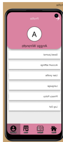
Fig 7: Profile Page

Each page is linked with interactive links in Figma so that users can try out the navigation flow as if it were a functioning application. These displays are then used as material for evaluating the clarity of the flow and visual comfort.